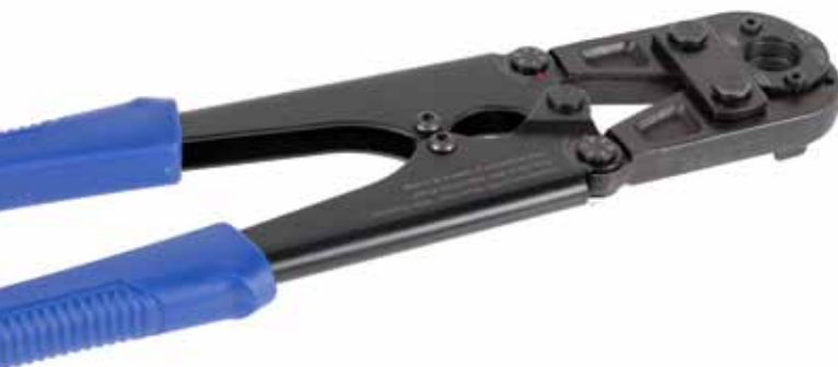
Manual Crimping Tool