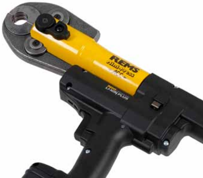
Battery Crimping Tool

Stainless ring will have three visible lines if it has been crimped correctly.