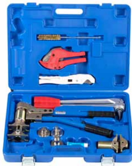
Manual Compression tool