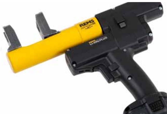
Battery Compression tool