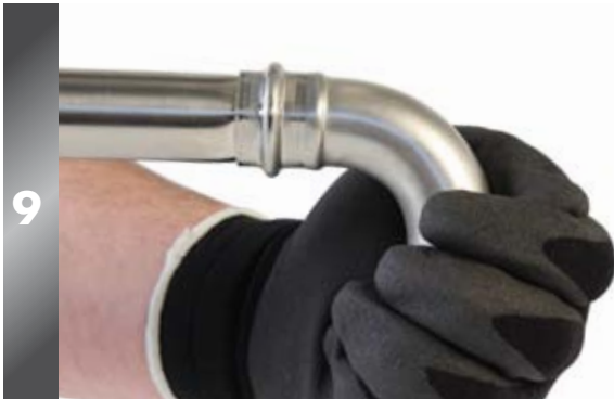
Inspect fitting to ensure press is complete.