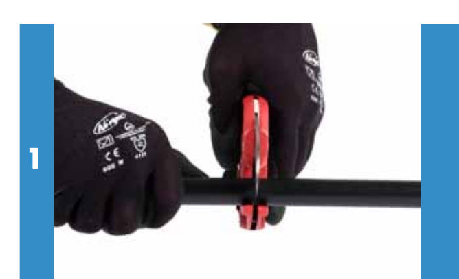
With a set of pipe cutters /shears cut the pipe at 90° ensuring the pipe is square on the end.

The following instructions explain the correct installation procedure for FORZA PEX Slide sleeve fittings in conjunction with FORZA PEX pipe.