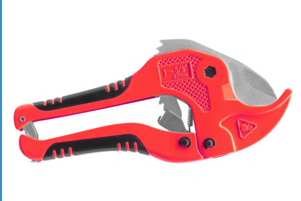
Forza Pipe Cutters