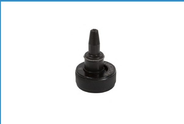
ForzaPlas Expander Heads Available in 16 and 20mm