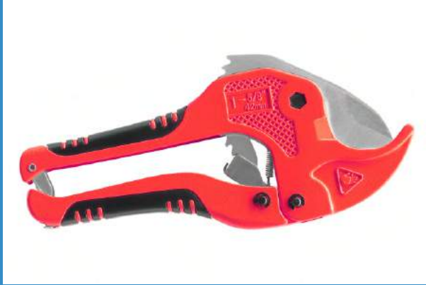
Forza Pipe Cutters