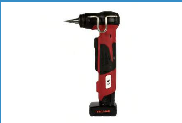
ForzaPlas Expansion Tool