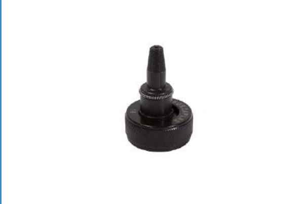
ForzaPlas Expander Heads Available in 16 and 20mm